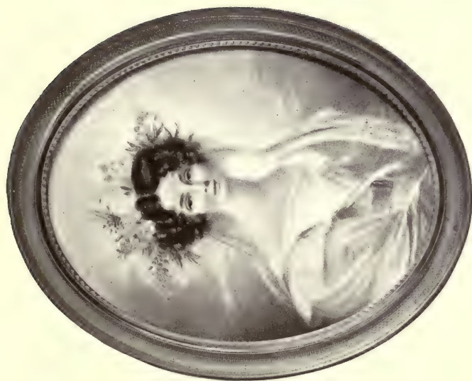
LA PRINCESSE DE LIEVEN (NÉE DOROTHY BENCKENDORFF) (1784-1857) BY E. W. THOMPSON